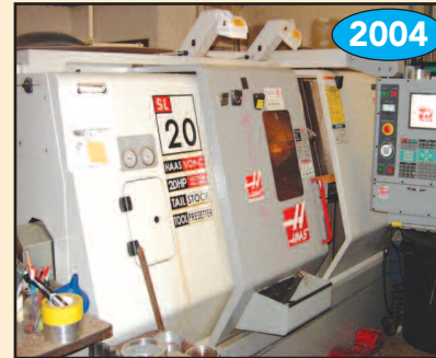
2004 Haas CNC Turning Center

BRIDGEPORT SERIES 1 MILL , 1 HP, 9" x 42" Table, S/N J157178 • 36" X 48" GRANITE SURFACE TABLE • HAAS CNC TURNING CENTER , Mdl. SL20T, 10.3" Max. Cut, Dia. x 200" Max. Length, Chip Auger (Oct. 2004), S/N 68666 • HAAS VERTICAL MACHINING CENTER , Mdl. VF3, S/N 13085, Table Size 48" x 18", (Jan 1998), Travles (X) 40", (Y) 20", (Z) 25", Spindle Speed 7,500 RPM, Spindle Motor 10/15 HP, Automatic Tool Changer 20 Stations, Spindle Taper Cat 40, Equipped with: Haas CNC Control, Coolant Tanks, Coolant Thru the Spindle, 4th Axis Ready (w/Drive), Rigid Tapping, Gearbox, Brushless Servos, Renishaw Probe, Programmable Coolant, Chip Conveyor, Floppy Drive • MORI SEKI CNC TURNING LATHE , Mdl. AL2, 2 Opposite Mandrels Bar Way Diam. 42, Max Turning Length 300, Yasnac Numerical Control, S/N 1288 • 1987 ARBURG INJECTION MOLDER , Mdl. 305, Material Hopper, S/N 136201 • QVAC VACUUM FORMER , Mdl. 207, S/N 5890T • CUTTING DIE ROLLER • EDGEPARK ELECTRICAL DISCHARGE MACHINE (EDM) , Wire, Mdl. EDM400 • HAAS ROTATING HOLDER • LIFTRITE ELECTRIC LIFT , Mdl. L68, 1600 Lb Cap., S/N 1916 • BISHAMAN 2000 LB PALLET JACK • ALL AMERICAN VERTICAL AIR COMPRESSOR , 5 HP, Tank 1989 • IMS GRINDER , Mdl. K1085, S/N 12 • 2' X 3' X 4" GRANITE SURFACE TABLE • STARCREST OPTICAL COMPARATOR , Mdl. HB35, Quara Check 2000 • MISCELLANEOUS TOOLING, MACHINE VISES, HANDTOOLS & SMALL POWER TOOLS