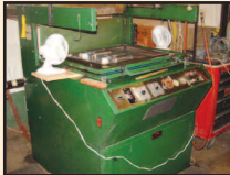
Qvac Vacuum Former