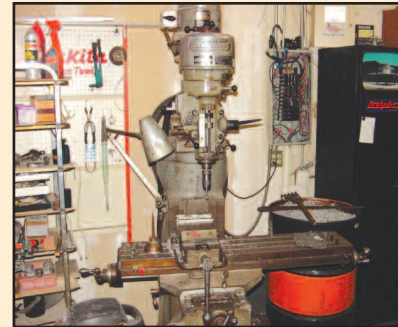
Bridgeport Series 1 Mill