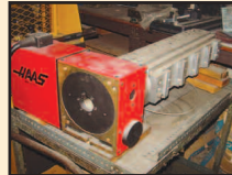
Haas Rotating Holder