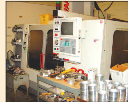
Haas Vertical Machining Center