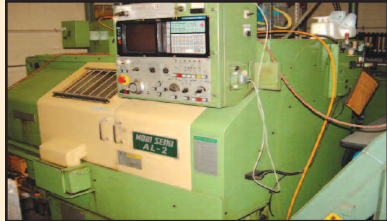
Mori Seki CNC Turning Lathe