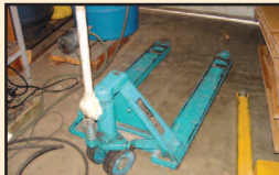
Bishaman 2000 Lb Pallet Jack