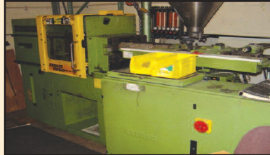
Arburg Injection Molder