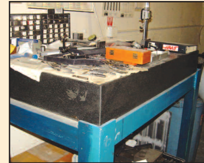
36" X 48" Granite Surface Table

TERMS: $300.00 Cash Refundable Deposit Required to Bid. 10% Buyers Premium. 25% Deposit required before departure. Payable in 24 Hours.